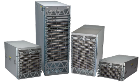
Figure 1: Arista 7500R Universal Spine platform.

Neither of these scenarios is desirable, or is true 'investment protection.'