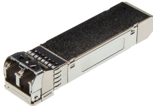
SFP-25G-MR-XSR: 10G/25G Dual rate SFP, up to 200m/300m over OM3/OM4 MMF