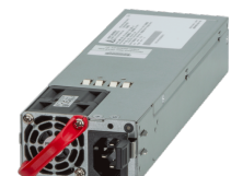
Hot swap power supplies