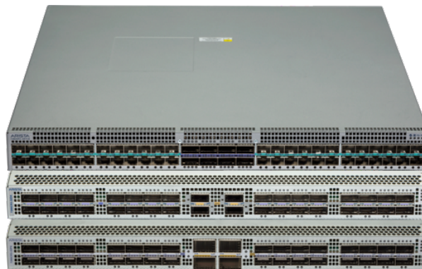
Arista 7280R3 MACsec systems

7280R3 encryption systems can be deployed in a wide range of open networking solutions including secure Data Center Interconnect (DCI), large scale layer 2 and layer 3 cloud designs, overlay networks and virtualized or traditional enterprise data center networks. Deep packet buffers and large routing tables allow for internet peering applications. The broad range of interfaces and density choice provides deployment flexibility.