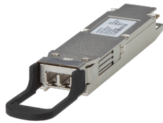
Figure 3: QSFP-DD Optics

The 7368X4 Series offers a choice of OSFP and QSFP-DD 400G modules as there are customers who prefer the QSFP-DD form factor, and some who prefer the OSFP. Both module types leverage the same system architecture, high performance and rich features. The two module types differ only in the type of interface, the OSFP or the QSFP-DD, and both allow for 4x100G and 2x200G mode when used with optical fiber and breakout cables and the use of existing 100G QSFP optics.