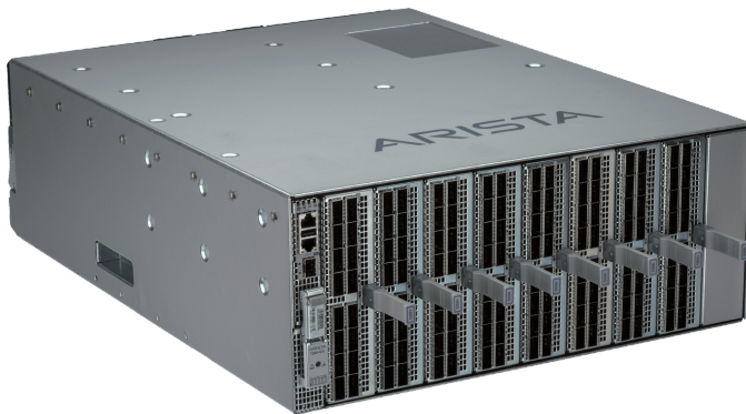
Figure 1: 7368X4

The Arista 7368X4 switches were designed for continuous operations with system wide monitoring of hardware and software components, simple serviceability and provisioning. Hot-swappable power supplies and five hot-swap fans provide dynamic temperature control combined with N+1 redundancy.