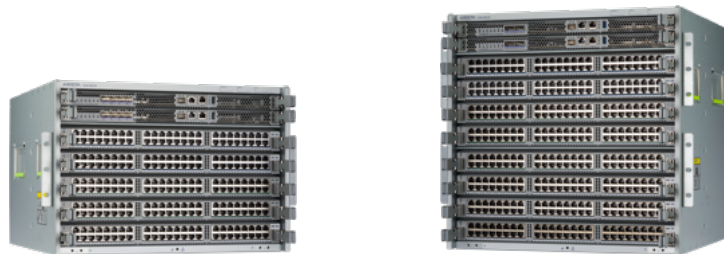
Arista 750 Series Modular Campus Switches

The 750 series enables both Layer-2 & Layer-3 designs, enabling scalable designs based on open standards for networking, while reducing complexity, automating provisioning and monitoring and eliminating the silos of networking in traditional campus designs. Proven technologies like MLAG enable active-active forwarding, while EVPN provides options for scalable segmentation across the campus taking advantage of VXLAN and extending consistent segmentation to the datacenter and beyond. The 750 Series deliver high performance combined with rich EOS innovations for resilience, pervasive security, simplified automation and network observability for the modern campus network.