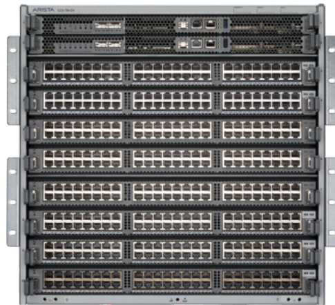
Arista 750 Series 8-slot