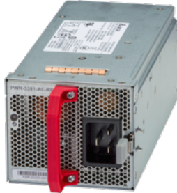
Arista 750 Series Power Supply (AC 3.3kW, front to rear)

The 750 Series fan modules deliver cooling to the entire system and are incorporated to the switch cards, with an efficient front to rear airflow, in common with the 720 Series fixed PoE switches. The compact design with integrated fans allowing the 750 Series to take just 10U and 7U respectively. Fan modules are individually removable, providing support for simple servicing with hot swap operation and no risk of system shutdown during maintenance windows. The 750 Series system has multiple temperature sensors monitoring critical resources and both inlet and exhaust air temperature. Fan speeds are dynamically adjusted by EOS to optimize system operation and reduce noise. The compact design on the 750 Series allows it to be installed in small wiring closets in both 2 post and 4 post racks, with front, center or rear mounting options. Convenient handles are provided for use during installation and to simplify future moves adds and changes.