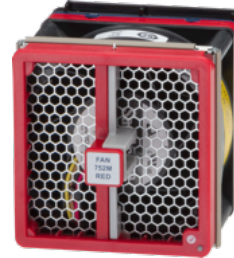
Arista 750 Series Fan Modules (front to rear)