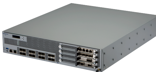
Arista ZTX-7250S MSS Traffic Mapper

To complete a zero trust policy the "last rule" drops any traffic not explicitly permitted. The ZTX-7250S then continuously monitors dropped traffic, providing insights for potential policy adjustments to explicitly allow new valid applications to connect to the network.